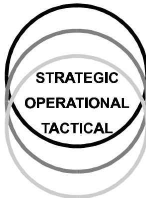
Figure 2. The Levels of War Compressed.

ing large military formations and multiple theaters. In such cases, there are fairly distinct strategic, operational, and tactical domains, and most commanders will find their activities focused at one level or another. However, in other cases, the levels of war may compress so that there is significant overlap, as shown in figure 2. Especially in either a nuclear war or a military operation other than war, a single commander may operate at two or even three levels simultaneously. In a nuclear war, strategic decisions about the direction of the war and tactical decisions about the employment of weapons are essentially one and the same. In a military operation other than war, even a small-unit leader, for example, may find that “tactical” actions have direct strategic implications.